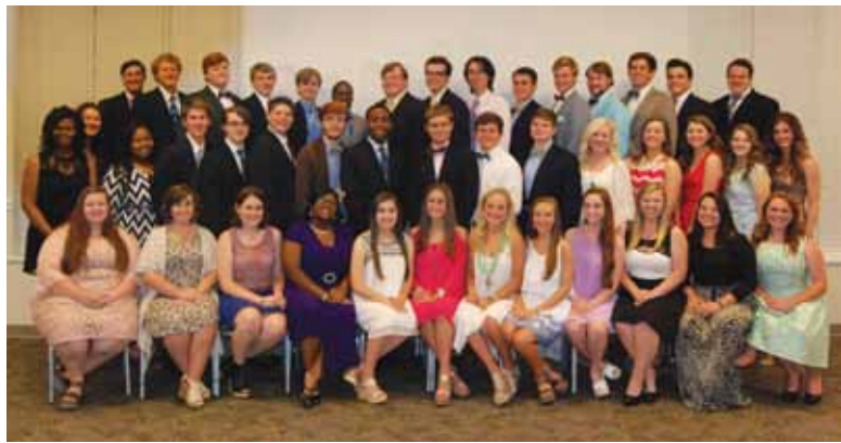
The graduation banquet for Youth Leadership Dothan-Houston County Class XXIII was recently held at Wiregrass Rehabilitation Center Inc.'s Sterling Events Services Rotary Hall. The class had 44 graduates.

Leadership Dothan had two projects. The first was to sell tickets for JonJam 2015 and help with setup and work the event. The proceeds from JonJam help fund the R.E.A.L. Project (Refurbished Equipment Assisting Lives), which is a central place for people to bring any used medical equipment for people with disabilities