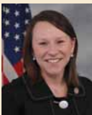
Rep. Martha Roby

Rep. Martha Roby will be the guest speaker at the Dothan Area Chamber of Commerce's General Membership Luncheon scheduled for Tuesday, Aug. 25, at 11:30 a.m. at Wiregrass Church.