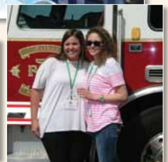
Public Safety Day