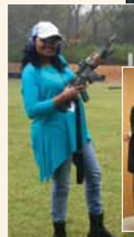
Public Safety Day