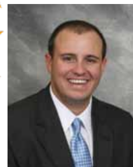
Hunter Green Todd and Sons