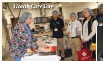
Health Care Day