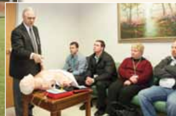
Health Care Day