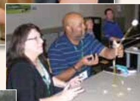
Economic Development Day