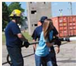
Public Safety Day