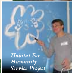
Habitat For Humanity Service Project